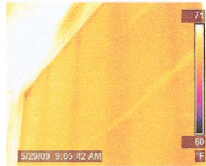
4" Studs / 16" O.C. 1/2" Sheetrock 3/4" Strapping / Furring 3/4" Thermal 3Ht R-11 Fiberglass 7/16" OSB R-Value 19.5